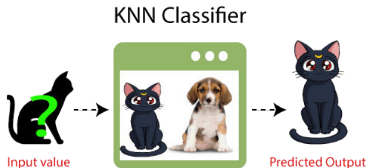
Fig.1. KNN model identification technique

Example: Suppose, we have an image of a creature that looks similar to cat and dog, but we want to know either it is a cat or dog. So for this identification, we can use the KNN algorithm, as it works on a similarity measure. Our KNN model will find the similar features of the new data set to the cats and dogs images and based on the most similar features it will put it in either cat or dog category (as shown in Fig.1).